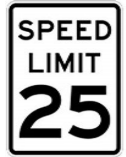
Figure 2: San Francisco Road Speed Limit

San Francisco Road is an urban local street with an Average Daily Traffic (ADT) of 695 vehicles (Counter 1), 613 vehicles (Counter 2), and 471 vehicles (Counter 3) which includes less than 1% heavy vehicles (buses and trucks), and an existing speed limit of 25 mph. See Appendix A for further information.