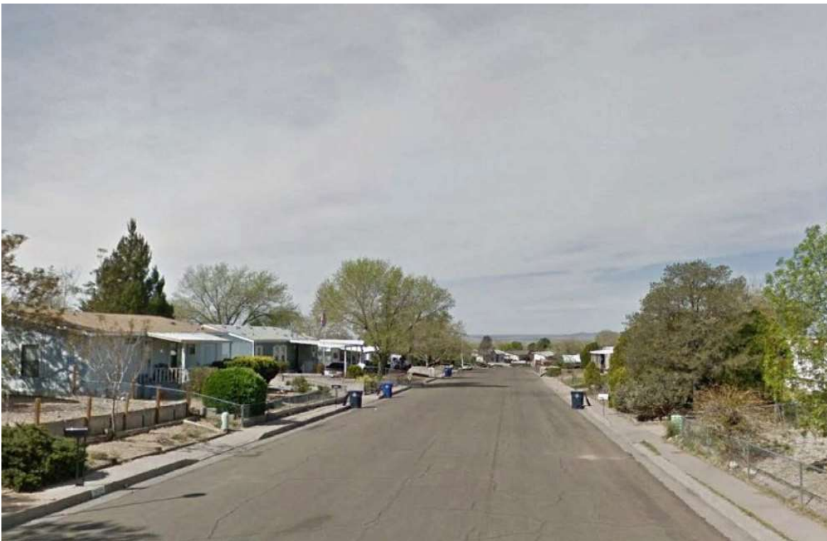
Figure 4: San Francisco Road Looking West