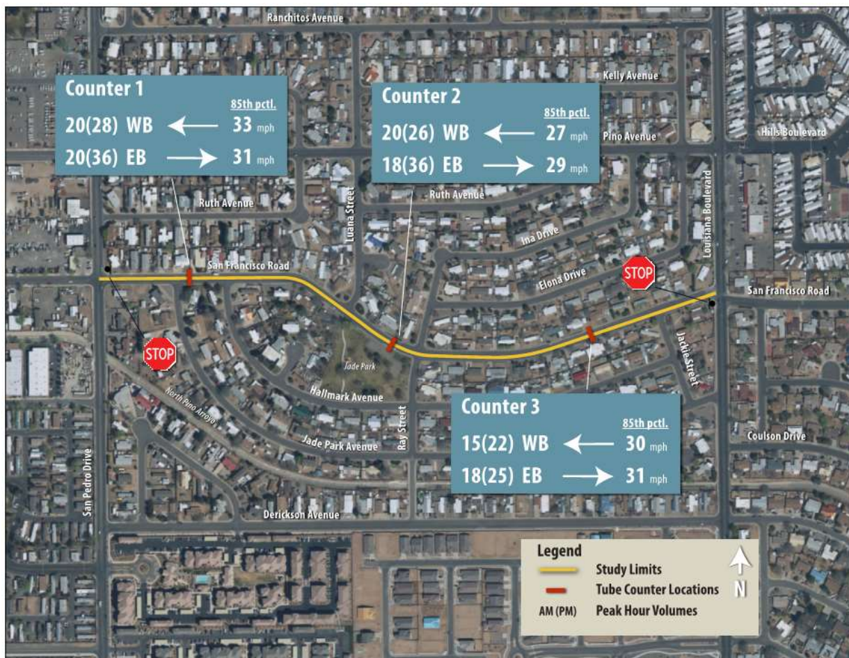
Figure 1: Project Area and Existing Traffic Volumes

San Francisco Road is located in Albuquerque, New Mexico, and is a two-lane, undivided local street that runs east-west. San Pedro Drive and Louisiana Boulevard are both three-lane, undivided minor arterials. San Pedro Drive runs north-south and intersects the western end of the project area, while Louisiana Boulevard runs north-south and intersects the eastern end of the project area. Both streets cross San Francisco Road at a cross-intersection. See Figure 1 for a map of the project area. The project area is located in a residential area approximately one half-mile south of Paseo Del Norte Boulevard and approximately one half-mile east of Interstate 25.