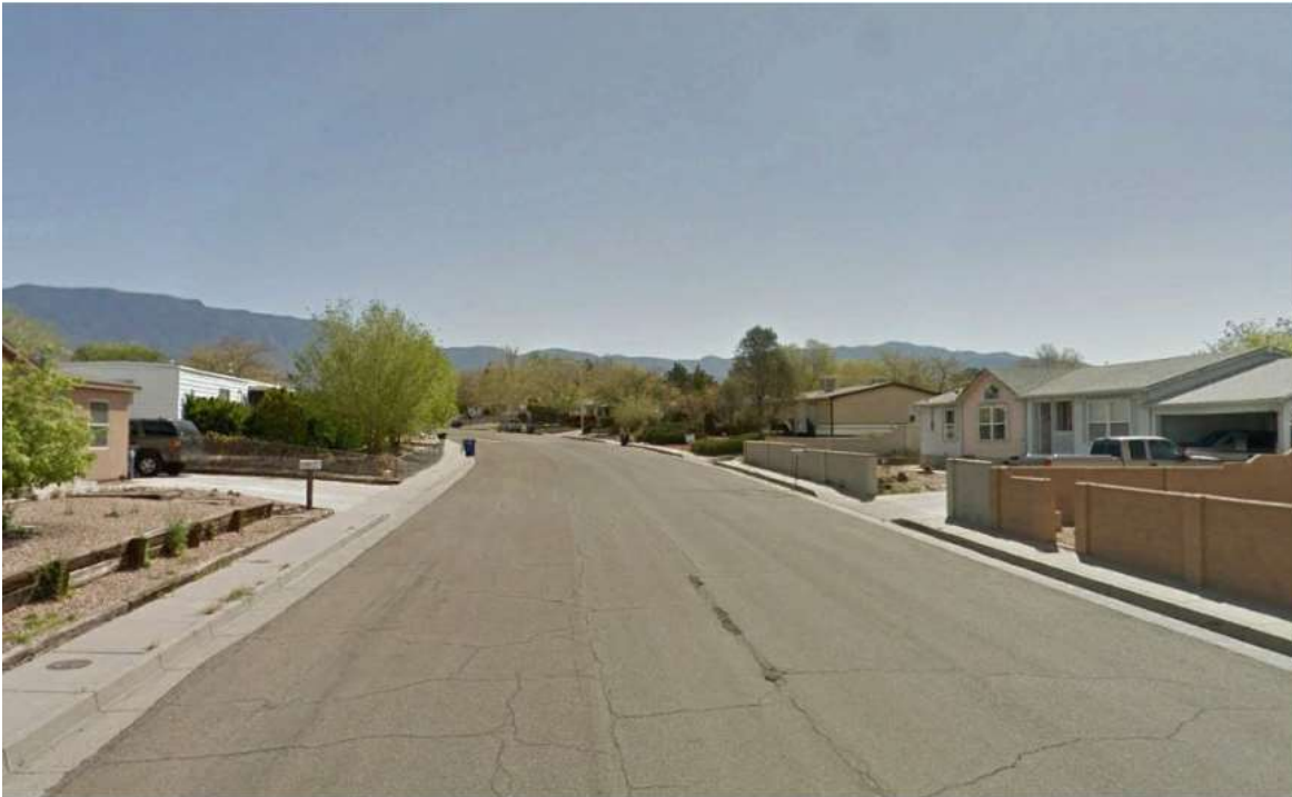
Figure 3: San Francisco Road Looking East